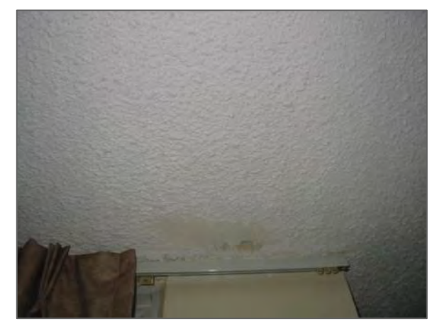
Sprayed limpet texture ceiling on lath