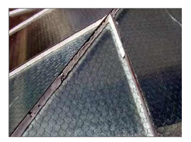
Caulking at Glazing