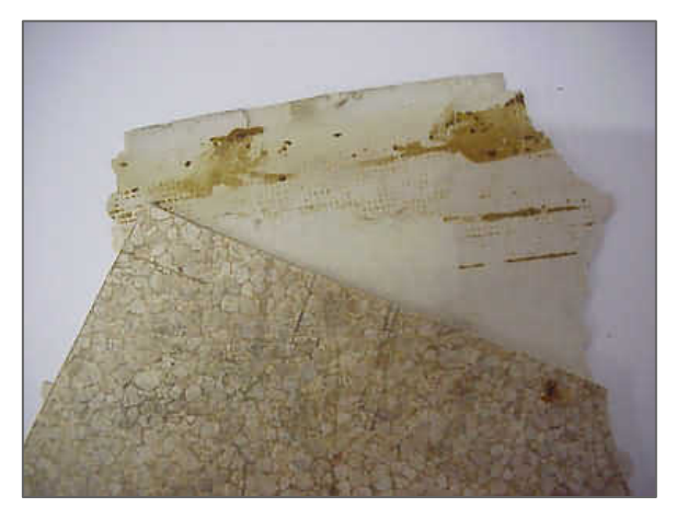
Vinyl sheet flooring with paper underpad