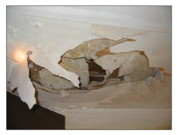
Plaster on wood lath

Plaster is non-friable in place but removal is impossible without causing it to become friable. This is significantly different than lay-in acoustic tiles or transite boards which can be removed intact.