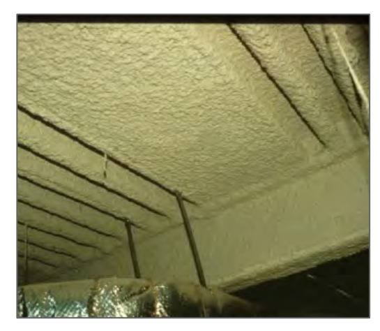
Cementitious sprayed fireproofing

Several types of fireproofing or insulation were applied by spraying or trowel application in the period from the mid 1930's to 1974. Fibrous products were spray applied after being blown as a dry mix through an application gun. These products may contain up to 90% asbestos and any of the three major types (chrysotile, amosite or crocidolite). Cementitious products were trowelled or sprayed as a wet slurry. These were harder products that did not contain more than 25% asbestos. Only chrysotile asbestos was used in the cementitious type materials.