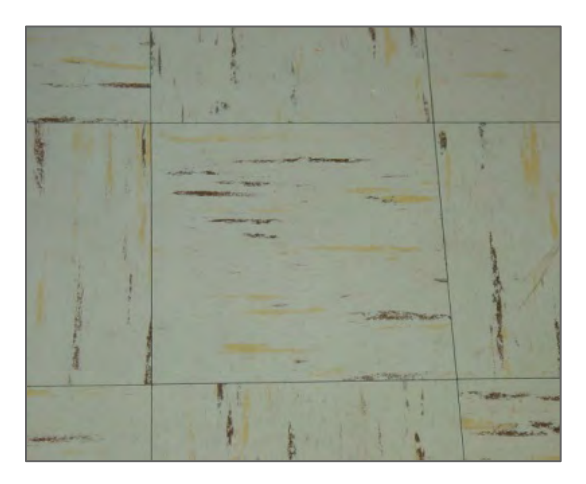
Vinyl asbestos tile