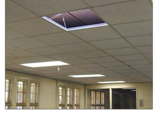
Glued on (laminated) ceiling tiles