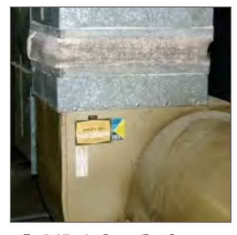
Textile Vibration Damper/Duct Connector

Asbestos textile materials are manufactured from chrysotile fibres. Two types of yarn are produced: plain, possibly braced with organic fibres, and reinforced, which incorporates either wire or another yarn such as nylon, cotton or polyester. Major uses for asbestos textiles are gaskets, packings, vibration damper/duct connectors, friction materials, thermal and electrical insulation, and fire resistant applications, e.g. welding curtains, protective clothing, theatre curtains, hot conveyor belts and ironing board covers. These products may be considered or become friable in use. Asbestos textiles are no longer in widespread production.