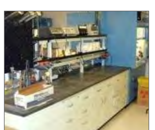
Laboratory Bench Countertop