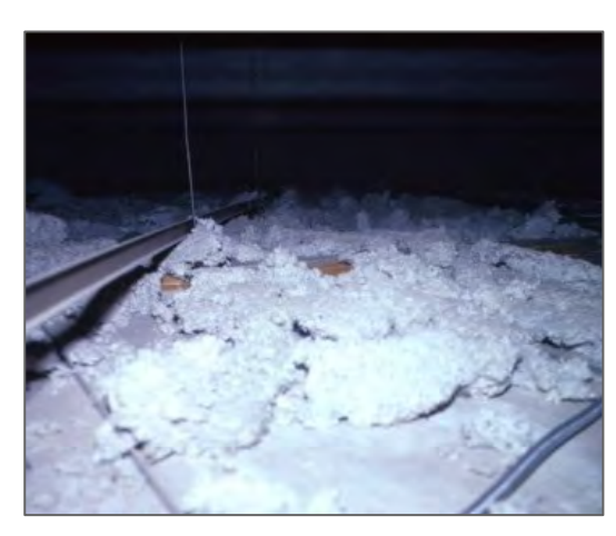
Debris from fireproofing on top of ceiling