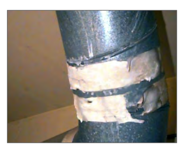
Paper on seams of duct