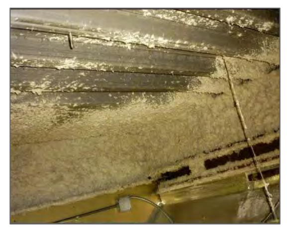
Fibrous sprayed fireproofing (beam only)