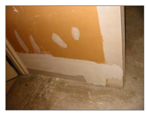
Drywall joint compound on drywall

Drywall joint compound also contained asbestos until the early 1980's. The concentration is quite low (near or less than 5%; always chrysotile). The product in place is quite hard and is normally treated as non-friable.