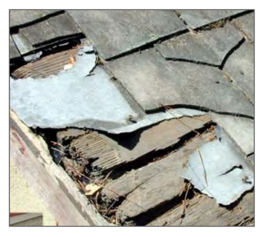
Building paper under roof tiles