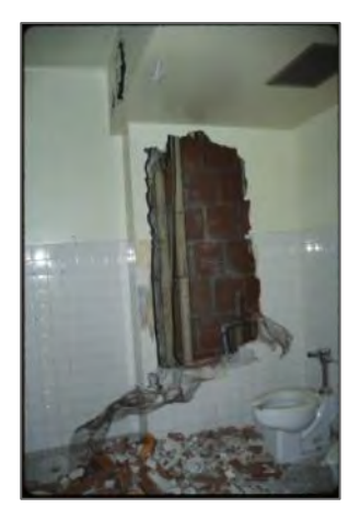
Plaster on speed tile