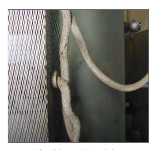
High Voltage cable insulation