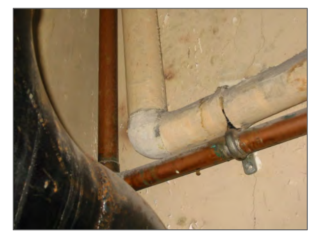
Parging cement on pipe fitting