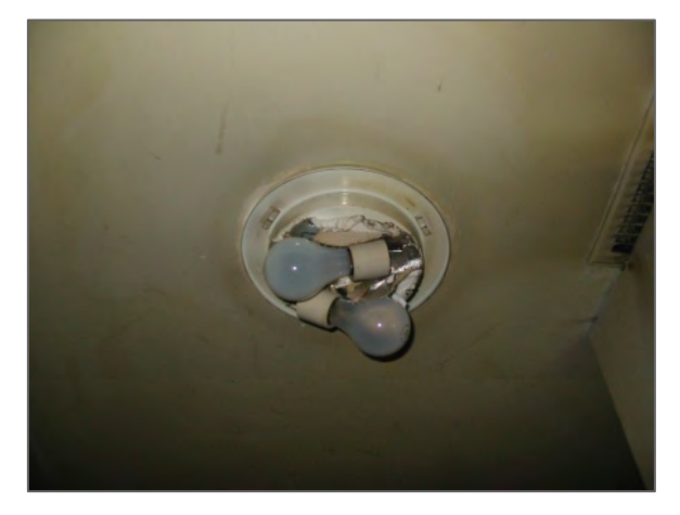
Paper heat shield on incandescent fixture

insulation. Some of these applications are discussed under the headings "Insulation" and "Gaskets and Packings".