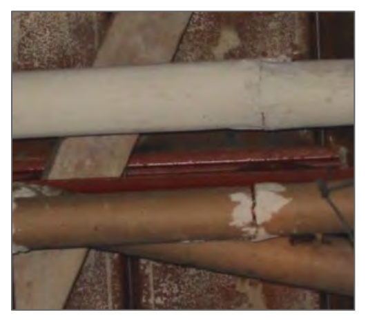
Parging cement on sweatwrap and Aircell