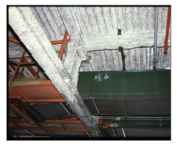
Fibrous sprayed fireproofing