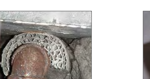
Aircell insulation (corrugated paper)